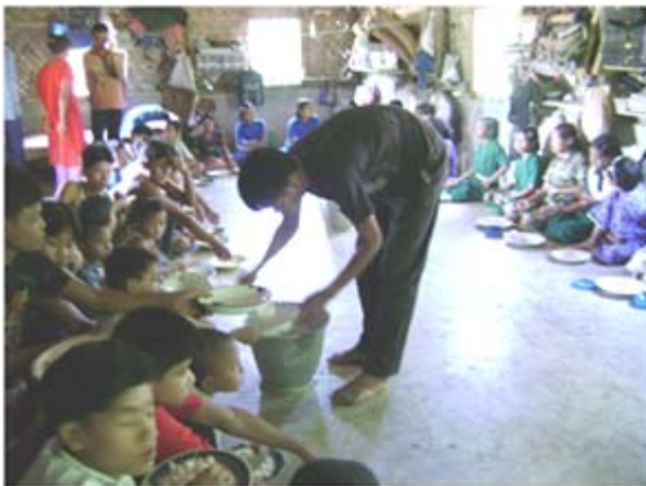
Children are taking food in dormitory as they have no dining hall

1.4 Formation of Hostel construction and maintenance sub committee: Management Committee will form a sub-committee that will be responsible for overall construction