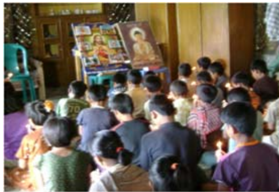
Children observe both Christian & Buddhist theme

3.3 Organize regular sports, cultural & religious event: every day regular sports and religious prayer and at least weekly cultural events shall be organized by the care taker of the Hostel to provide them recreation facilities as well as to develop their cultural & religious mentality.