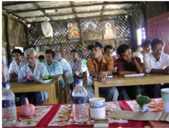
Meeting with parents

1.2 Formation of Students' Parents Committees (SPC): The objective of the formation is to organize community people (Male and female) at grassroots level under their own leadership to identify the problems related child home and to undertake self-initiatives to overcome and to provide service organized way. Community will be encouraged to take active participation in decision making process and to help Hostel management providing time to time advice as when needed. Quarterly meeting will be held to review the progress of hostel and children