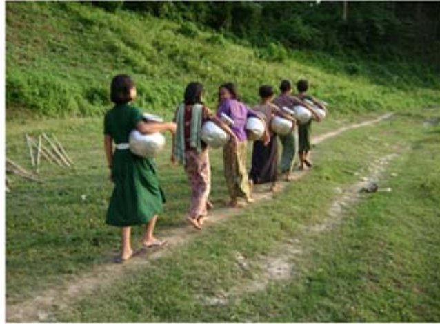
Girls fetching spring water from quite far distance