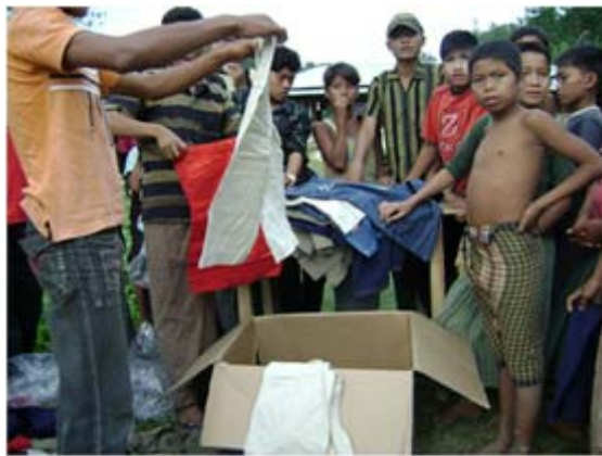
Distribution of Clothes