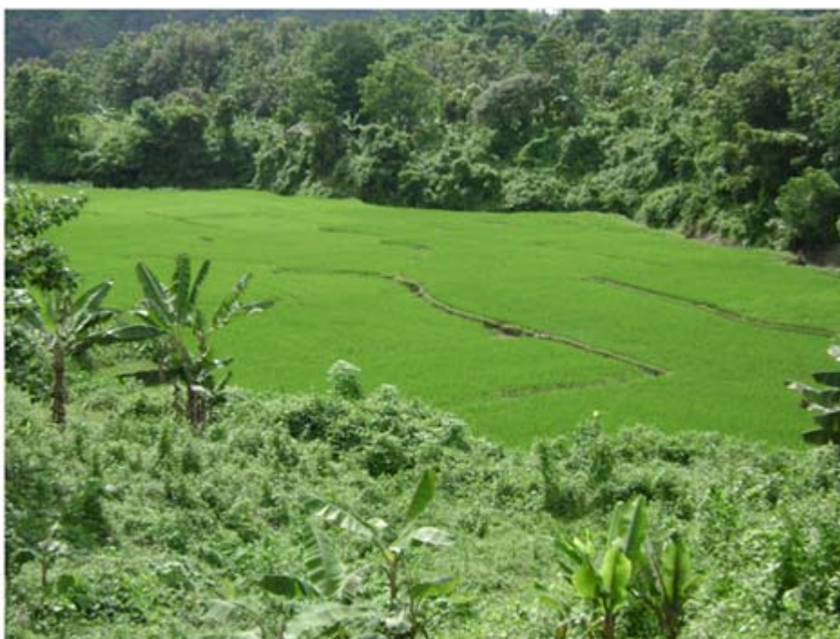
Hill Child Home will follow this model toward sustainability