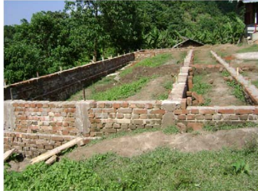
Incomplete Construction of girl dormitory