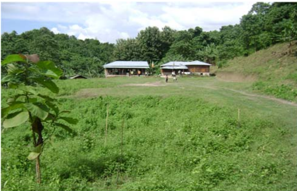
Hill Child Home at present

Tribal communities lost their own heritage, which threaten their existence. Situation obliged them to slowly and steadily losing their language, culture, customs and tradition. Adivasi/tribal minorities have no ability for policy or decision influencing which badly affects day to day life and livelihood. Therefore they are victims of social, political and economic discrimination and injustices. Children and women rights situation is most awful. They are deprived from education, health, nutrition, safe drinking water and sanitation as results they are victims of mortality and morbidity, disability, discrimination.