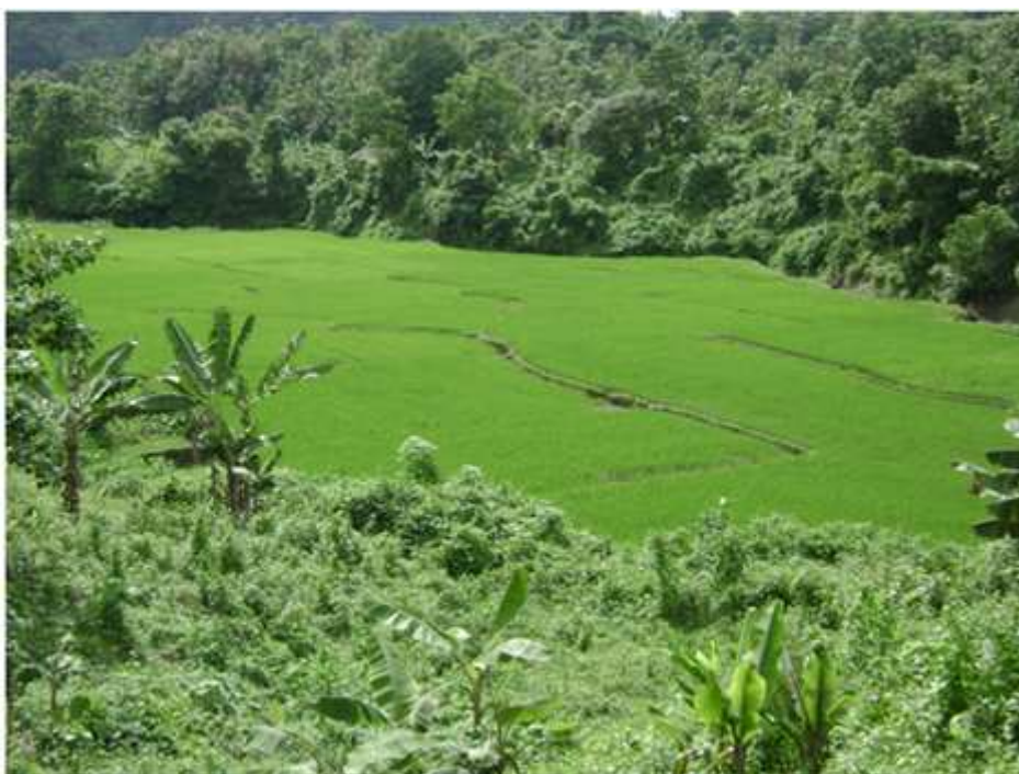
Hill Child Home will follow this model toward sustainability