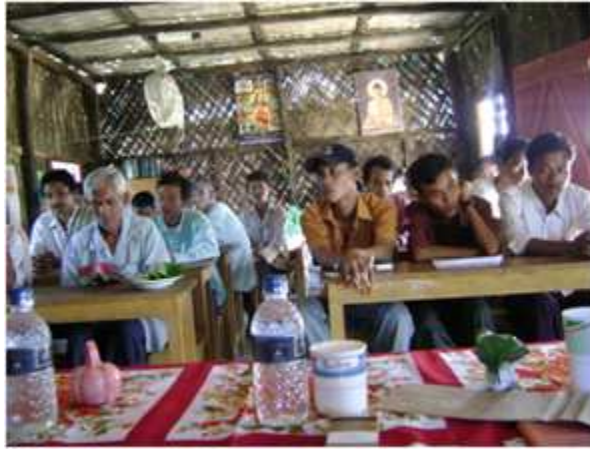
Meeting with parents