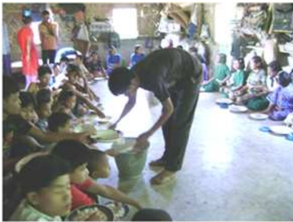
Children are taking food in dormitory as they have no dining hall

of the hostel or repairing say, procurement of materials, engagement of necessary labor, and supervision of construction work being accountable to Management Committee (EC). Specially it will construct a dormitory for girls, kitchen, toilet/Bath, dining hall, and install a deep tube well, water supply to ensure safe water for the children under the project.