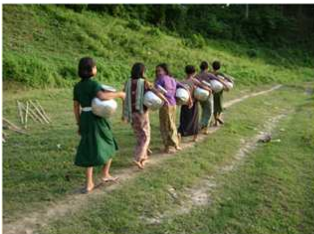
Girls fetching spring water from quite far distance