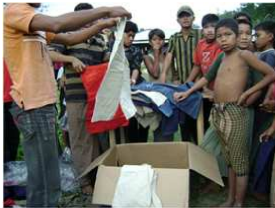
Distribution of Clothes