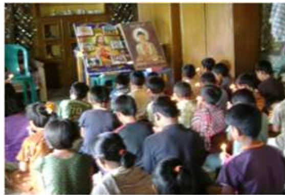
Children observe both Christian & Buddhist theme

3.3 Organize regular sports, cultural & religious event: every day regular sports and religious prayer and at least weekly cultural events shall be organized by the care taker of the Hostel to provide them recreation facilities as well as to develop their cultural & religious mentality.