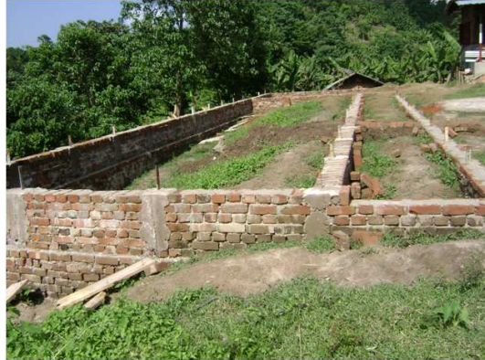
Incomplete Construction of girl dormitory

Under the above miserable situation I was strongly encouraged and have established (Mongyeo Marma) in 2006 the Children Home. I got cooperation from some social minded youth and some Buddhist monks. I also got cooperation from the parents of children as well as community people toward establishment of the children home. In the mean time I am trying my label best to get support from local source and able to collect financial support and contribution locally from different sources like; from friends circle, prominent rich men. Thus with my own financial involvement and locally collected donation I was able to construct a dormitory and office and the kitchen. In addition our community people provided some contribution to start another one dormitory especially for the girl children but it is quite insufficient to complete the construction of the same. As we have given priority for admission to the orphans, disabled, and distressed children. Therefore it is very difficult to have support from their parents however we will try to make them understand to contribute as per their ability. Now I am some how running the organization knocking door to door of different rich persons but get response very few of them.