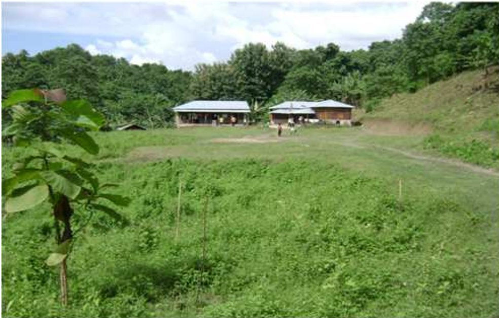
Hill Child Home at present

Tribal communities lost their own heritage, which threaten their existence. Situation obliged them to slowly and steadily losing their language, culture, customs and tradition. Adivasi/tribal minorities have no ability for policy or decision influencing which badly affects day to day life and livelihood. Therefore they are victims of social, political and economic discrimination and injustices. Children and women rights situation is most awful. They are deprived from education, health, nutrition, safe drinking water and sanitation as results they are victims of mortality and morbidity, disability, discrimination.